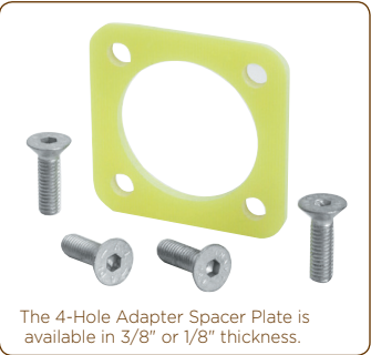
The 4-Hole Adapter Spacer Plate is available in 3/8" or 1/8" thickness.

The 4-hole adapter spacer plates are ISO tested and are light weight. Both spacer plates measure 2" x 2".